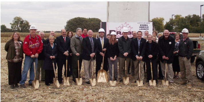
Above: Lochmueller Groundbreaking Right: Walgreen: (adjacent)