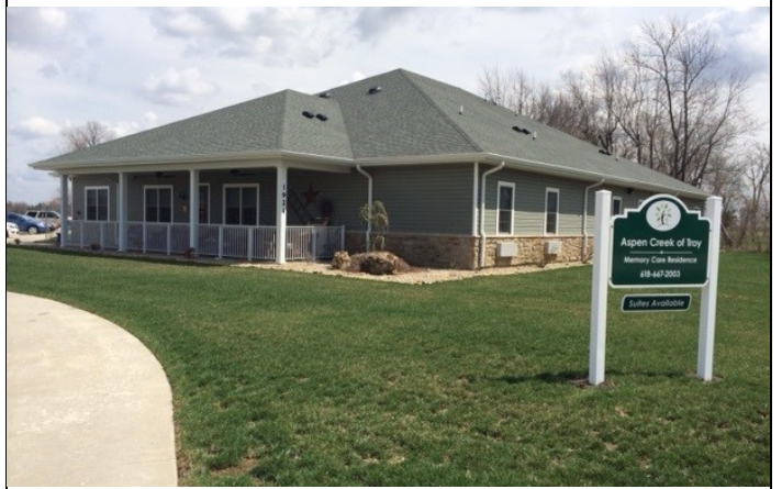
Above: Aspen Creek, Left: The Fountains,